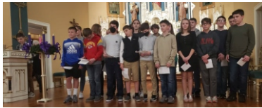
6th, 7th & 8th Grade