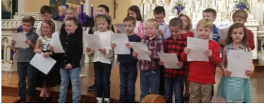
K & 1st Grade

Thank you to all the students, catechists and assistants for providing a wonderful program!