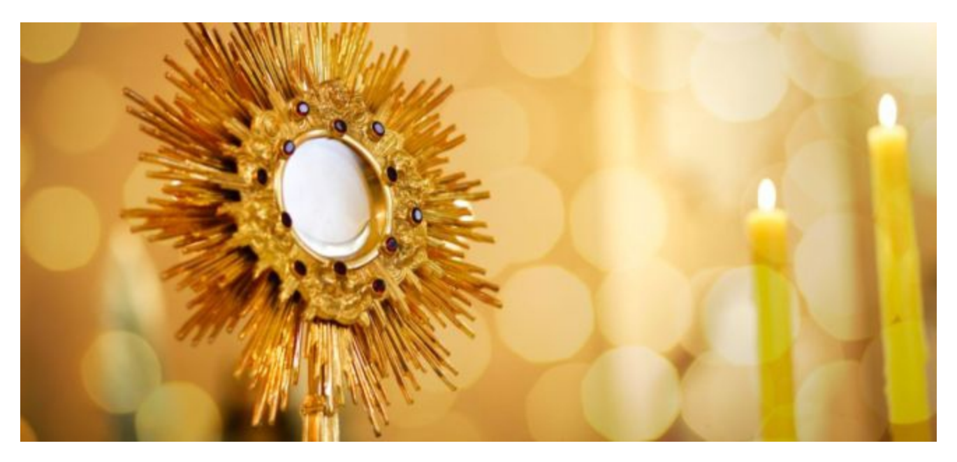
Hello Sacred Heart Parishioners!

A significant number of individuals have expressed an interest in having Eucharistic Adoration at Sacred Heart.